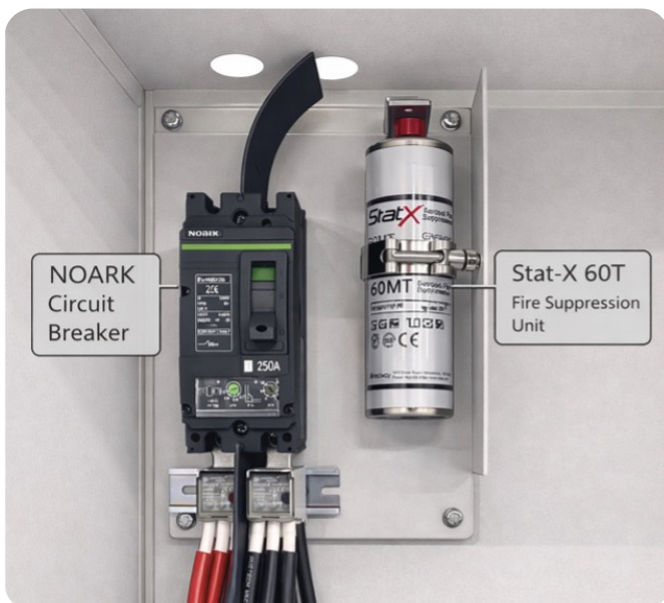
Installed in PEF8 Cabinet