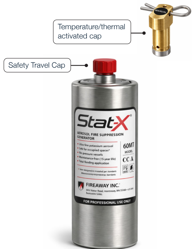
Stat-X fire suppression system