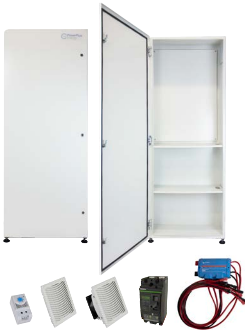
Supplied with PEF6.