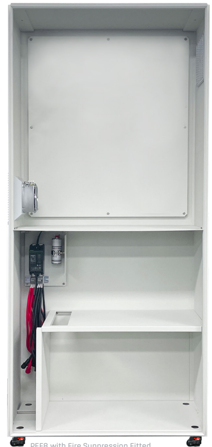
PEF8 with Fire Suppression Fitted